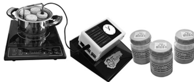
FIG. 1. PiAstra equipment and FH human milk treatment setup. FH, flash-heat.

The FoneAstra was modified to make it more cost-effective by using the shelf modular Raspberry Pi technology